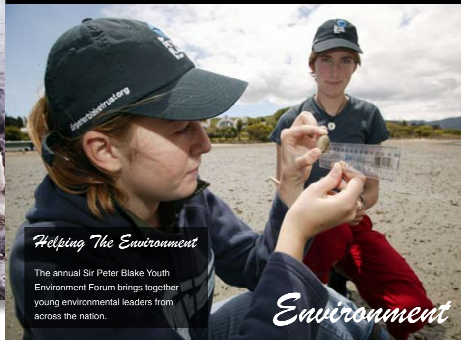
Helping The Environment

The Trust has an Antarctic Youth Ambassador Programme which supports a young New Zealander to do environmental work with Antarctica New Zealand.